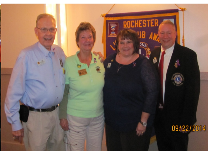
Keeping it in the family - The Leach den of "LIONS"